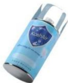
250/110ML REFILLS H-524