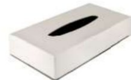
FLAT DISPENSER (S) H-226