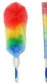
FEATHER DUSTER WITH CAP C-539