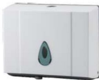
MINI QUADRATE DISPENSER H-207