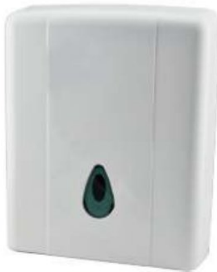
QUADRATE DISPENSER H-202