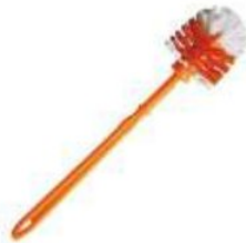
TOILET BRUSH ROUND C-523