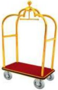
LUGGAGE TROLLEY (XL) C-124