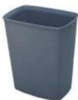
8L/10L DUSTBIN (SQUARE) D-229-230