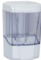
SOAP DISPENSER AUTOMATIC H-326