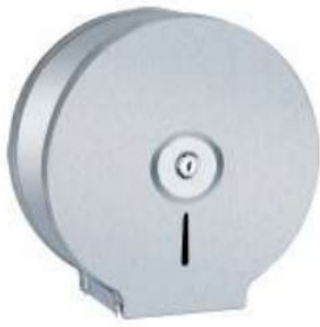
SS CIRCULAR DISPENSER H-211