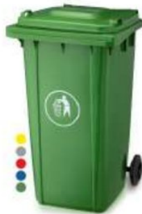
240 LTR DUSTBIN D-214-218