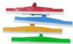
C-552/553 Blue & White Squeeze 18"/22"