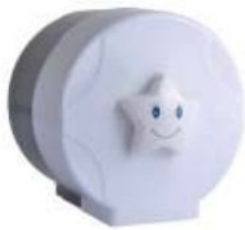
MINI CIRCULAR DISPENSER H-217