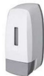
SOAP DISPENSER 1000 ML H-336