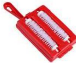
CARPET ROLLER C-549