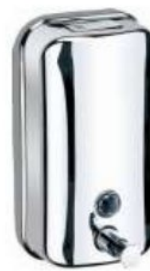
SS SOAP DISPENSER - 1000ML H-335