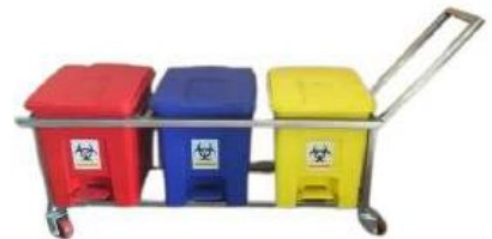
SS DUSTBIN TROLLEY D-134