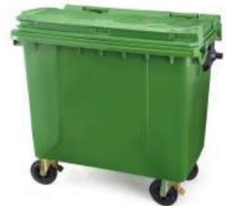
1100 LTR DUSTBIN D-220A