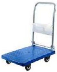
LUGGAGE TROLLEY (ABS) C-120