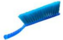
CARPET BRUSH (S) C-512