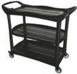
UTILITY CART (S) C-109