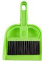
DUST PAN WITH BRUSH (MINI) C-518