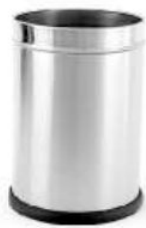
PLAIN BIN (7 X10/ 8X12/ 10X14) D-104-106