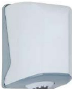
CENTRE PULL DISPENSER H-224