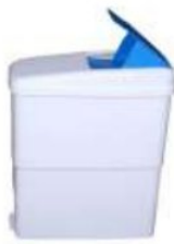
FEMININE BIN D-232