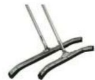
METAL HOLDER SQUEEZE 18"/22" C-558/559