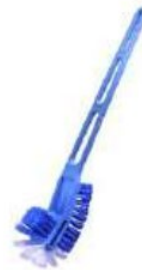
TOILET BRUSH DOUBLE HOCKEY C-527