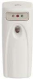
AUTOMATIC ROOM FRESHNER (LED) H-401