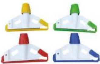
MOP CLIP C-418