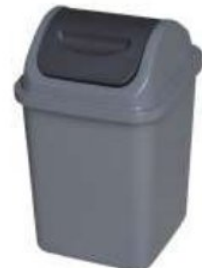
25/60 LTR SWING BIN D-227-228