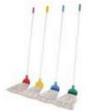
WET MOP SET C-415