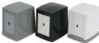
CUBE DISPENSER H-225