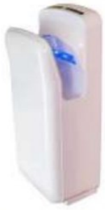
JET HAND DRYER (BIG) H-101