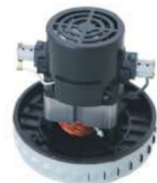
SINGLE STAGE MOTOR