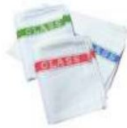
GLASS CLEANING CLOTH C-322