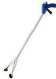
LEAF PICKER C-248