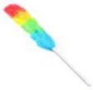
FEATHER DUSTER (S) C-537