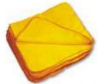
YELLOW CLEANING CLOTH C-324