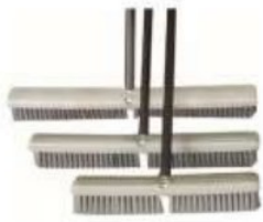
ROAD BRUSH 18"/24" (H) C-501/502