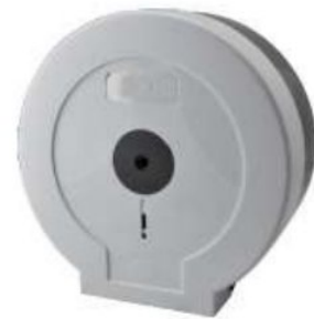
CIRCULAR DISPENSER H-213