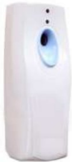
AUTOMATIC ROOM FRESHNER H-405