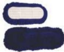
DUST MOP REFILL - 18" / 24" (BLUE) C-411B / 412B