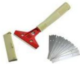
FLOOR SCRAPER C-228