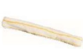
14"/16"/18" WASHER SLEEVES A-221-223