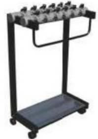
UMBRELLA HANGER (12"/18") C-130/130A