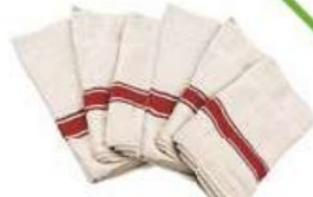
MOP CLOTH C-323