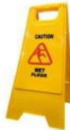
CAUTION SIGN BOARD C-208