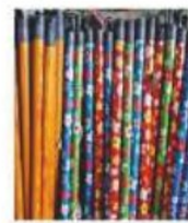
WOODEN STICK C-435