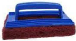
HAND SCRUBBER C-547