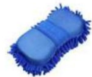
SPONGE CAR (H) C-567