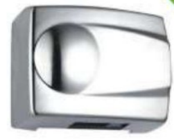
SS HAND DRYER (MINI) H-104