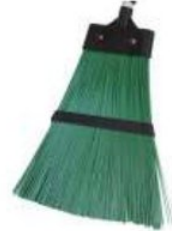
GARDEN BRUSH C-511