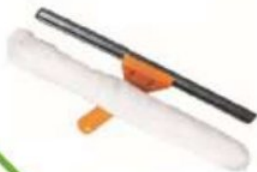
16" COMBI C-214