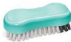
CLOTH BRUSH C-533