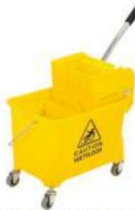
20LTR WRINGER TROLLEY C-115