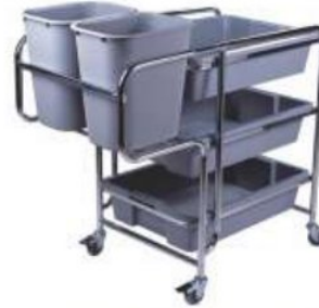
RESTAURANT TROLLEY (SS) C-112 Size: 108cm x 59cm x 98.5cm