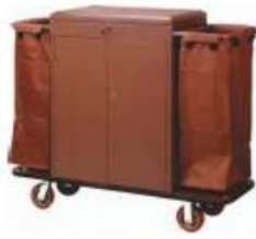
MULTIFUNCTIONAL SERVICE CART (MS) C-102 Size: 142 x 46 x 115cm