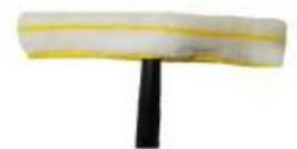
14"-18" WINDOW WASHER C-222-224