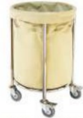
LAUNDRY CART (ROUND) C-108