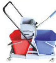
40 LTR WRINGER TROLLEY (S) C-116C