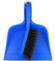
DUST PAN WITH BRUSH (H) C-520