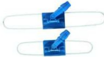
DUST MOP FRAME 18" / 24" C-411A / 412A