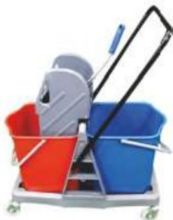
50 LTR WRINGER TROLLEY C-117