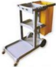
JANITORIAL CART C-104 Size: 21.5" x 42.5" x 29.5"