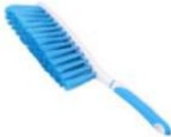
CARPET BRUSH (B) C-514