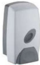
SOAP DISPENSER - 800ML H-322