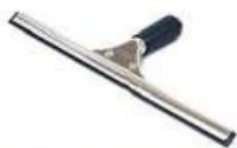
10"-18" WINDOW SQUEEZE (SS) C-215-218