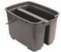
2 POCKET BUCKET C-113