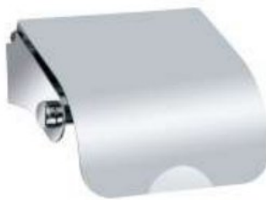
TISSUE PAPER HOLDER (SS) H-219