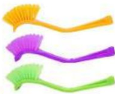
SINK BRUSH C-531