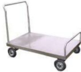
LUGGAGE TROLLEY (SS) (S) C-121