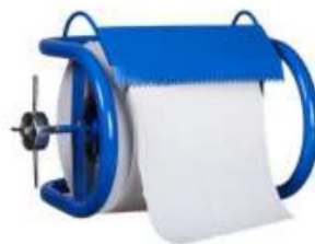
KITCHEN ROLL DISPENSER H-227