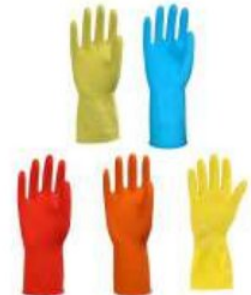
LATEX GLOVES C-325