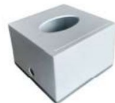
POP UP DISPENSER H-228