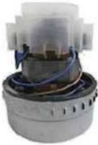
VACUUM MOTOR (WHITE)