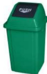
25/60 LTR PUSH BIN D-225-226