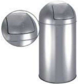
PUSH BIN (10 X 14/14 X 32) D-115/116