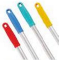
ALUMINIUM POLE C-425