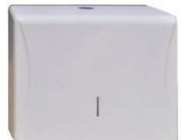
MINI QUADRATE DISPENSER H-208