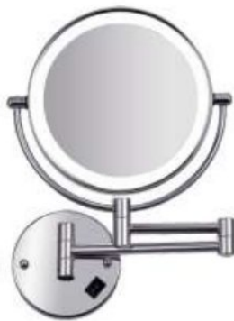
8" MAGNIFYING MIRROR H-410