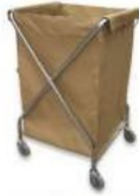
X SHAPE LAUNDRY CART (SS) C-105 Size: 62.5cm x 62cm x 98.5cm