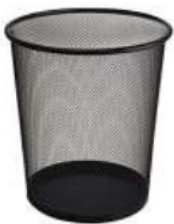
MESH BIN (SM/L) D-206-208