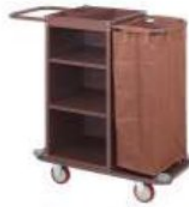
MINI SERVICE CART (MS) C-102A Size: 83 x 46 x 111cm