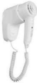
HAIR DRYER H-107