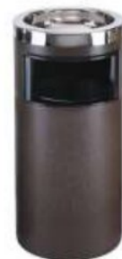
ASHTRAY BIN (IMPORTED) D-203