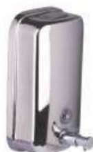
SS SOAP DISPENSER - 800ML H-334