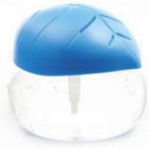
AIR REVITISOR (LED) H-407A