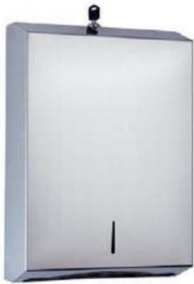
SS QUADRATE DISPENSER H-201