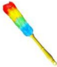
FEATHER DUSTER (M) C-538