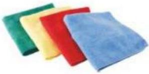
MICROFIBER CLOTH (40x40/ 40x60/ 60x60) C-301-320