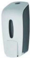
SOAP DISPENSER (600ML) H-321