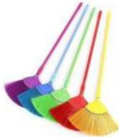
DAIMOND BRUSH C-509