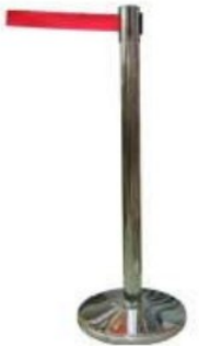
QUEUE MANAGER C-131A