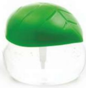
AIR REVITISOR (M) H-407