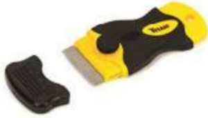
PLASTIC WINDOW SCRAPER C-231