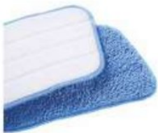
ALUMINIUM DRY MOP REFILL - 18" (VELCRO) C-406