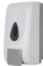
SOAP DISPENSER ABS (BLUE) H-323