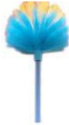
JALA BROOM C-510