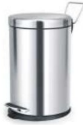
SS DUSTBIN PEDAL (5L/7L/11L) D-107-109