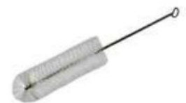
BOTTLE BRUSH C-535