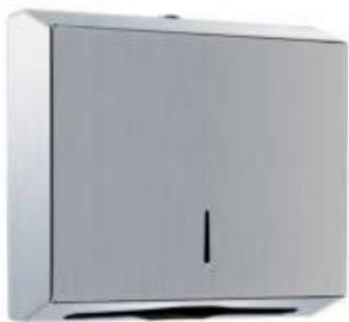
SS MINI QUADRATE DISPENSER H-206