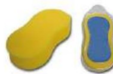
SPONGE (COMPRESSED) C-566