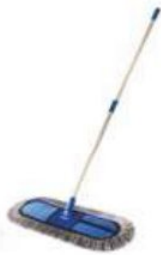
DUST MOP SET 18"/24" C-408/409