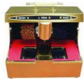
SOLE CLEANING MACHINE GOLD C-256 GOLD/SILVER