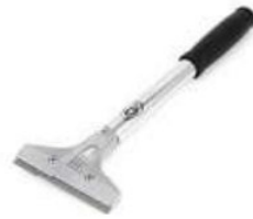
LONG HANDLE FLOOR SCRAPER C-230