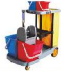
MULTIFUNCTION JANITORIAL CART C-103 Size: 125cm x 51cm x 95.5cm