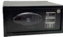
SAFE LOCKER C-600