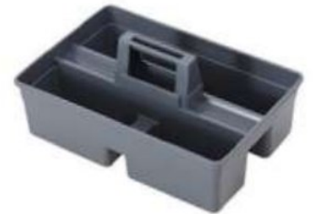
CADDY/ TOOL BASKET C-201