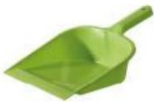
DUST PAN C-521