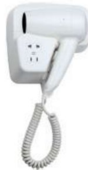
HAIR DRYER WITH SWITCH H-108