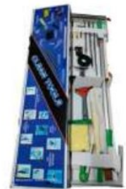
WINDOW CLEANING KIT C-212