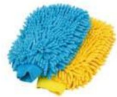
HAND GLOVES (MICROFIBRE) C-550