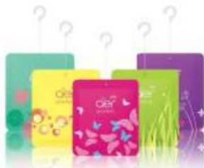
AER POCKET H-523