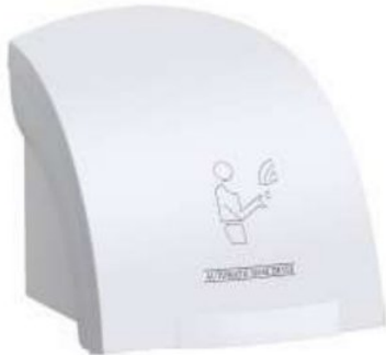
ABS HAND DRYER H-106