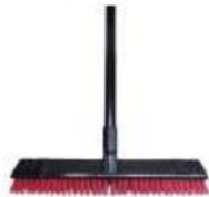
ROAD BRUSH 18" C-503