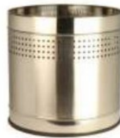
PLANTER (12 X 12/14X14) D-119/120