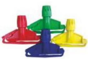
MOP CLIP C-417