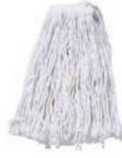
WET MOP REFILL UNLOOPED C-423