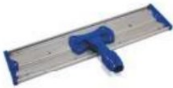
ALUMINIUM DRY MOP FRAME 18"/22" C-404