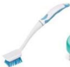
SINK BRUSH (H) C-532