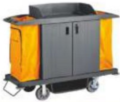
MULTIFUNCTIONAL SERVICE CART (Fibre) C-101 Size: 154 x 54 128.5cm