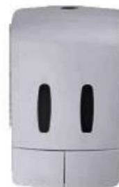
TWIN SOAP DISPENSER H-338