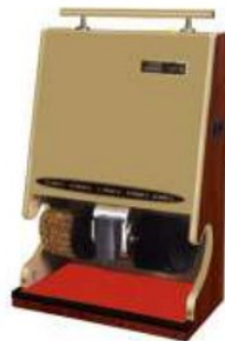
SHOE POLISH MACHINE (L) GOLD C-254 GOLD/SILVER