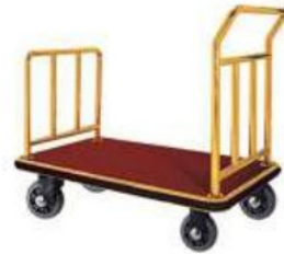
LUGGAGE TROLLEY (L) C-123