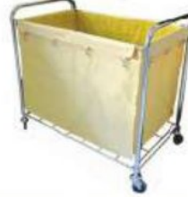
QUADRATE LAUNDRY CART (SS) C-106 Size: 89cm x 92cm x 56cm