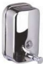
SS SOAP DISPENSER - 500ML H-333