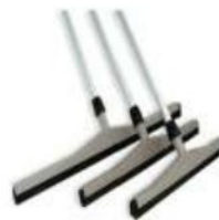
RUBBER HOLDER SQUEEZE 18"/22"/30" C-556/557/557A