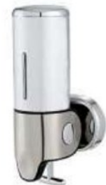
WALL MOUNTED SOAP DISPENSER H-328