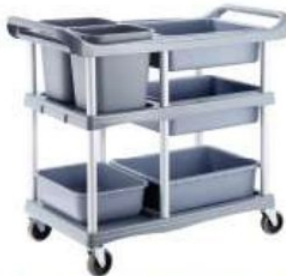
PLASTIC RESTAURANT TROLLEY C-110B