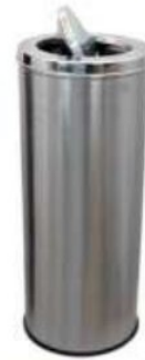
SS SWING BIN (8x12 / 10x14 / 12x14 / 12x28 / 14x28) D-110-114