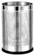
PERFORATED BIN (7 X10/ 8 X 12/ 10 X 14) D-101-103