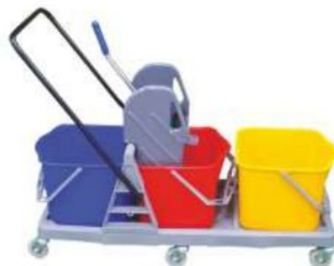
3 BUCKET TROLLEY (60Ltrs) C-119