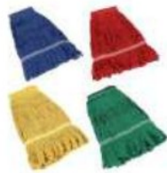
Wet Mop Refill Looped C-419