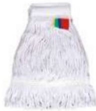
WET MOP REFILL LOOPED C-422