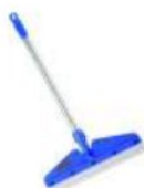
WIPER (H) C-562