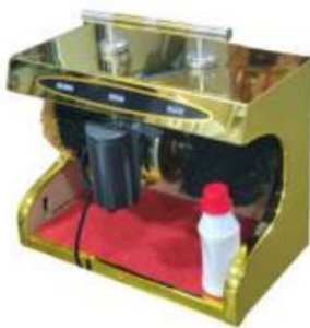
SHOE POLISH MACHINE (S/M) C-250/252 GOLD/SILVER