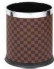
COATED DUSTBIN MESH BIN (S) D-205