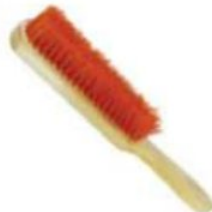
CARPET BRUSH WOODEN C-516