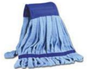
WET MOP REFILL MICROFIBRE (300 GMS) C-424