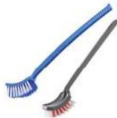
TOILET BRUSH SINGLE HOCKEY C-525