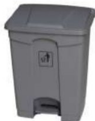
30/45/68/87 LTR PEDAL BIN D-221-224