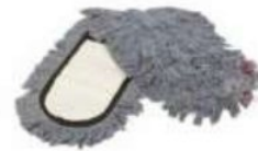
DUST MOP REFILL - 18" / 24" (GREY) C-411C / 412C