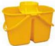
PORTABLE BUCKET C-114