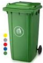
120 LTR DUSTBIN D-209-213