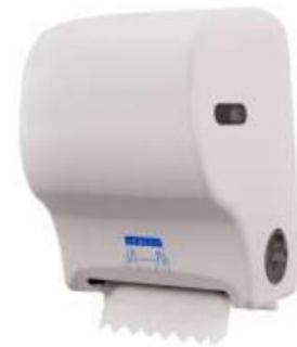
HRT AUTOCUT DISPENSER H-223