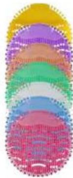
URINAL SCREEN H-501