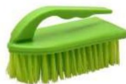
CLOTH BRUSH (H) C-534