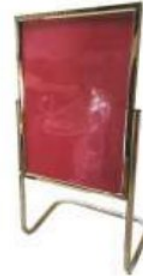
DISPLAY BOARD BIG C-126