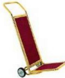
LUGGAGE TROLLEY (M) C-122