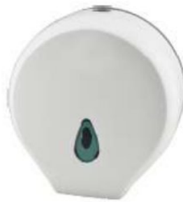
CIRCULAR DISPENSER H-212