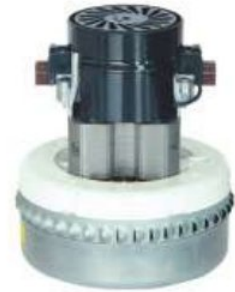
VACUUM MOTOR (AMETEK)