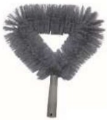
RINGED TUBE BRUSH C-240