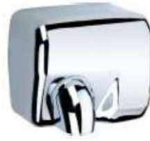
SS HAND DRYER (NOZZLE) H-103