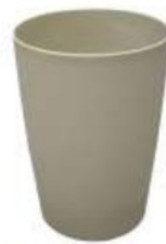
ROUND DUSTBIN D-231