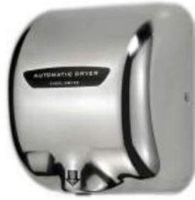
SS JET HAND DRYER H-102