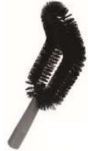
BENDED TUBE BRUSH C-239