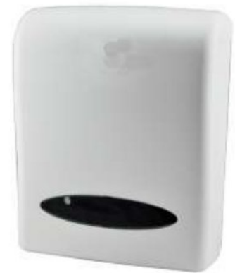
QUADRATE DISPENSER H-203