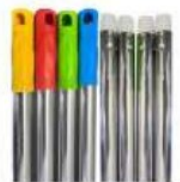
SS METAL ROD C-438