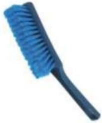
CARPET BRUSH (M) C-513A