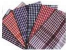
CHECK CLOTH C-321