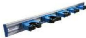
MOP HOLDER (ALUMINIUM) C-243