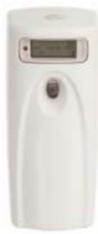
AUTOMATIC ROOM FRESHNER (LCD) H-402