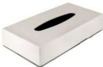
FLAT DISPENSER (M) H-226A